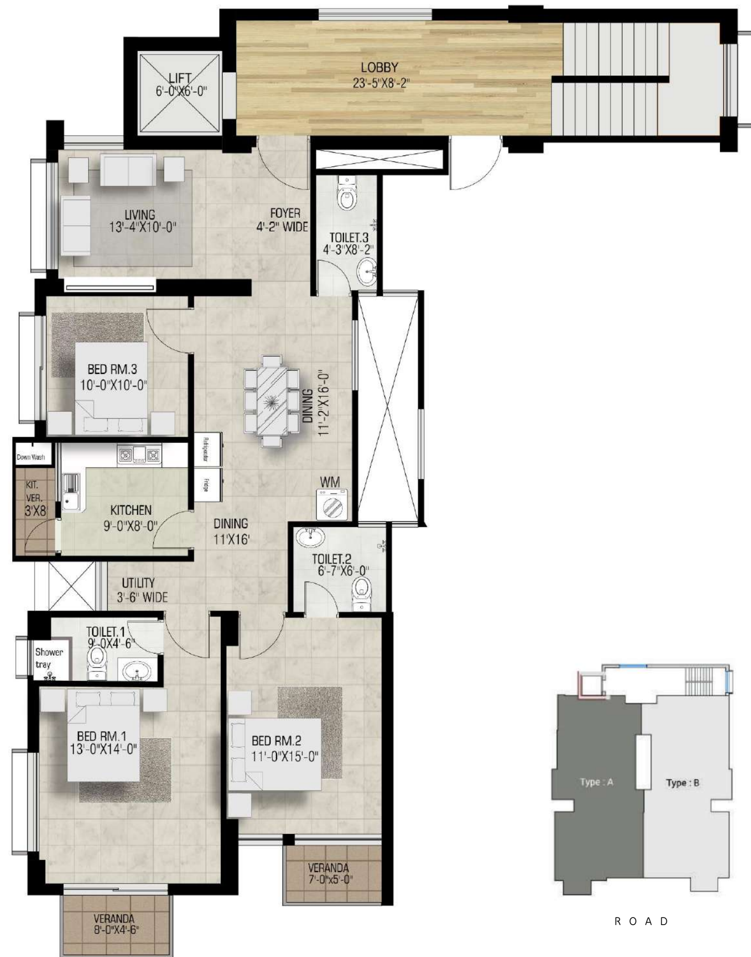
TYPE A (1726 SQFT)