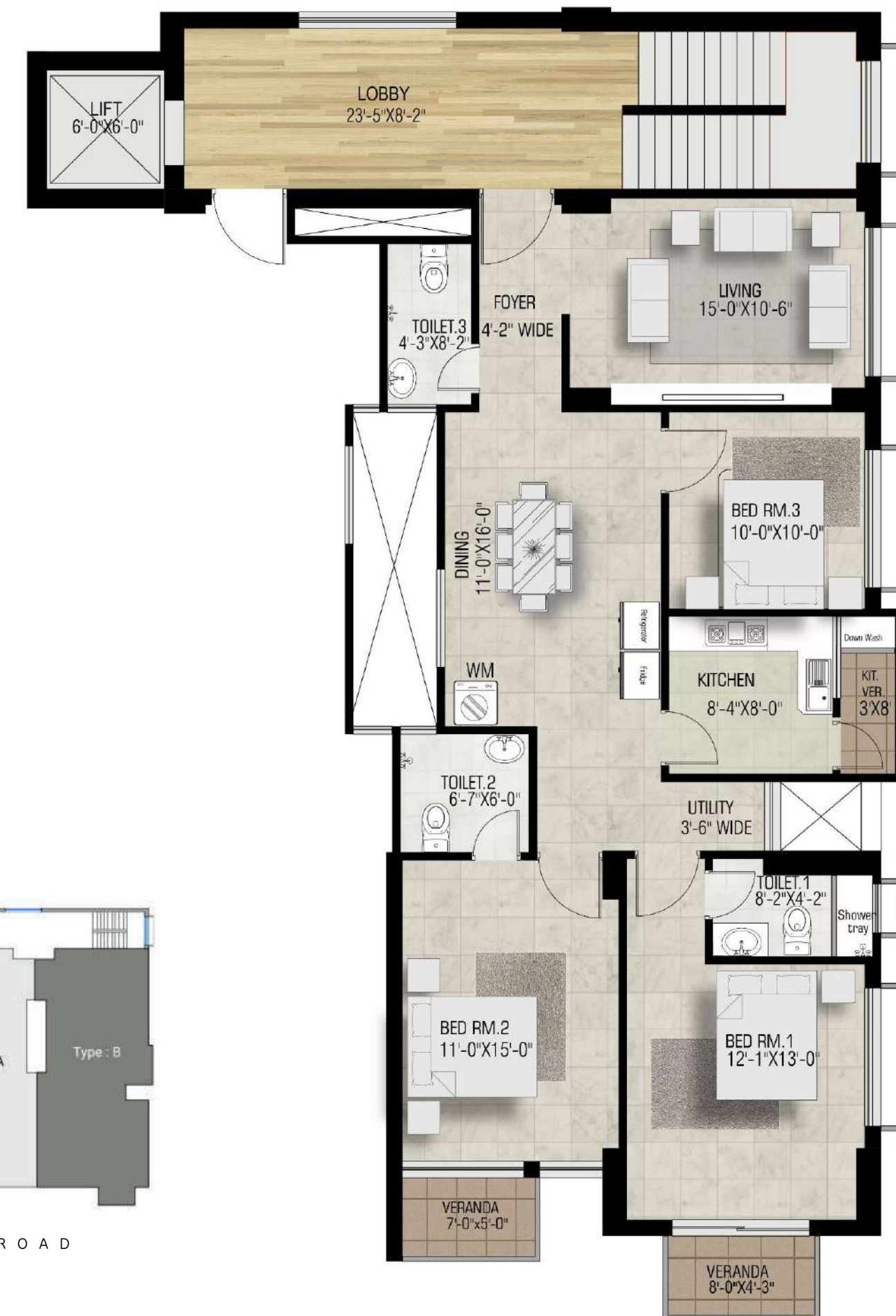
TYPE B (1697 SQFT)